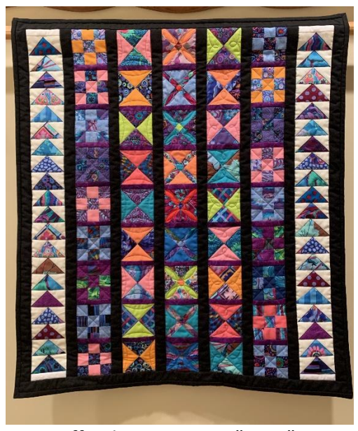
Kaffe Charming is 29" x 33"